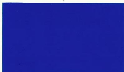
566 Blue Transparent