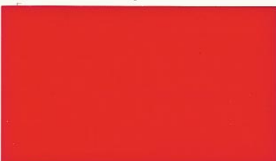
318 Red Transparent